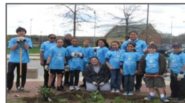
Project FOCUS "Dirty Hands Club"

FOCUS offers learning experiences in a 'fun' format such as the recent RAP contest based on good things happening at the South Lawrence East School and the Dirty Hands gardening Club where students are learning about nutrition while growing produce that they can bring home to their families.